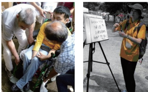
Left: Neighbors lifted the wheel chair up and down the stairs in the second year. Right: Announcements were written down on a board for the deaf.

In addition to disability awareness by community residents, participation in community activities by persons with disabilities have increased after they joined the community disaster drills.