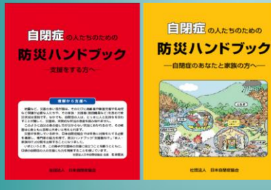
Fig.1 Disaster Preparedness Handbook for Service Providers (Left) and for Persons with Autism and their families (Right).

English Version: The DAISY version handbook is translated into English and will be distributed through the Internet for English Speaking people who live and visit areas that are