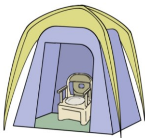
Commode chair and camp tent which can be used by wheelchair users

Sign board to display announcements for deaf residents. Previously, it took two months for sign language interpreters to arrive at the affected areas of the Great East Japan Earthquake.