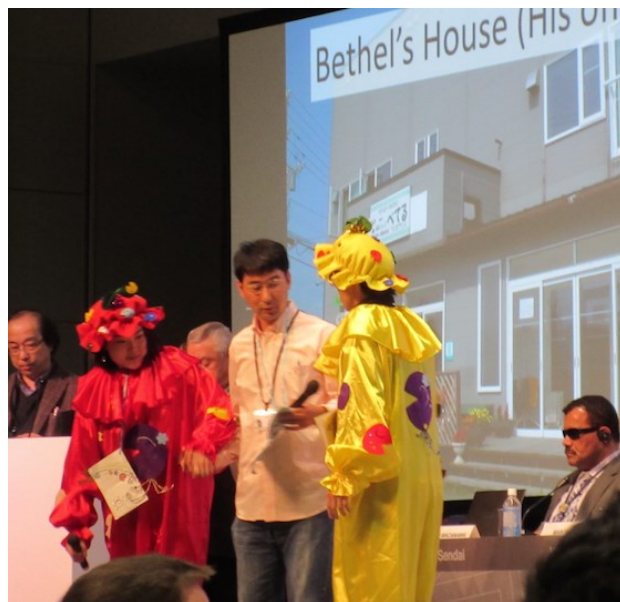
Bethel' House members at the World Conference on Disaster Risk Reduction

The Urakawa Team staged a short play in the Disability Working Session of the World Conference on Disaster Risk Reduction. The play demonstrated the unique difficulties people with schizophrenia experienced during the earthquake. Coping strategies were discussed with the members in social skill training sessions. The actor, who experienced visual hallucination during the earthquake, felt great sense of achievement in evacuating, after practicing the role-playing technique.