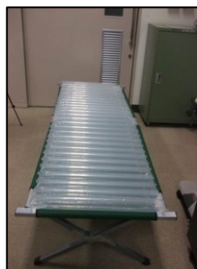
Portable camp bed and air mattress