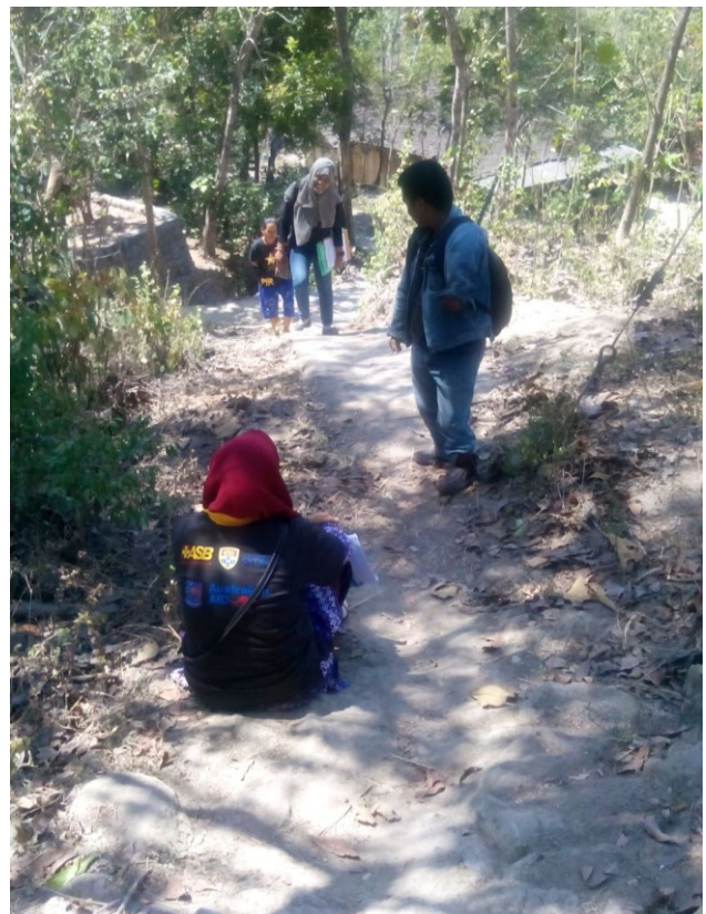
Survey team mates climbing up hill during the research (Acknowledgment to ASB Indonesia)

This was produced in Indonesia by the DPOs and people with disabilities involved in all aspects of the research and development project. Please watch this to hear firsthand about the experiences of people with disabilities and their motivation and capacity to participate meaningfully in policy, planning and programming in disaster risk reduction.