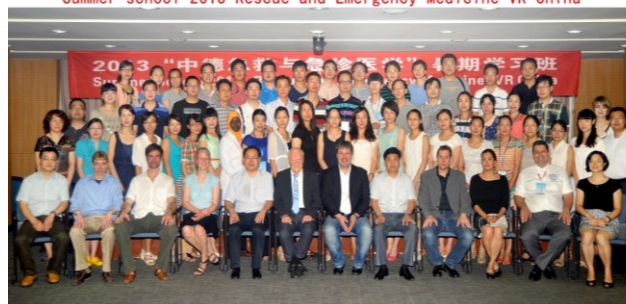
2013 “中德急救与急诊医学”暑期学习班 Summer school 2013-Rescue and Emergency Medicine-VR China

In the future, Tongji Hospital is planning to expand trauma and emergency medical practice, training and research, including in the areas of primary and advanced life support of trauma victims, first aid for sudden mass casualties, leakage of chemical and biological agents and protection from nuclear contamination. We will organize staff to study in Germany the establishment and organization of air ambulance policies and services. It is planned that Wuhan City will be the first site to carry out first aid and air transport, with Tongji Hospital as an air-rescue operation unit. Our goal is to ensure a high-quality, emergency and disaster relief system covering Hubei Province.